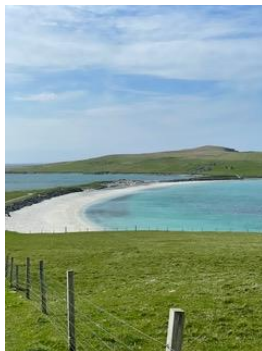
Tombolo at St Ninian's Beach

Beautiful unspoilt beaches and crystal-clear water surround the islands and you will most definitely not be surrounded by bathers and sun worshippers. The cliffs at Eshaness are truly spectacular with a scenic breezy walk along the tops, but not for the faint hearted.