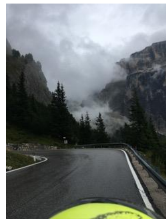
Timmelsjoch high mountain Road Italy

Planning an overtake of a cyclist climbing a steep mountain road at 2-3 mph needs to be well thought out. The hairpin is not the place to carry out the manoeuvre!!