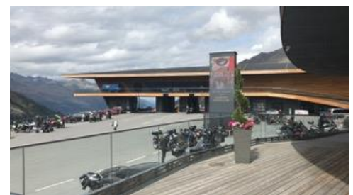
Motorcycle museum on the mountain

That's why it's called a "Skills for Life" course.