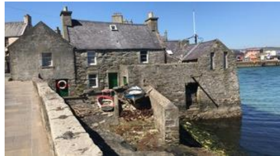
‘Jimmy Perez’ house

It became apparent how clever the producers of the “Shetland” series featuring Jimmy Perez have been. Many of the stunning locations used for filming are nowhere near Lerwick but have been filmed to utilise the outstanding rugged scenery in some locations, in particular, the iconic beaches with white sand and turquoise coloured clear water.