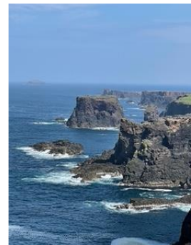
Cliffs at Eschaness

Beautiful unspoilt beaches and crystal-clear water surround the islands and you will most definitely not be surrounded by bathers and sun worshippers. The cliffs at Eshaness are truly spectacular with a scenic breezy walk along the tops, but not for the faint hearted.